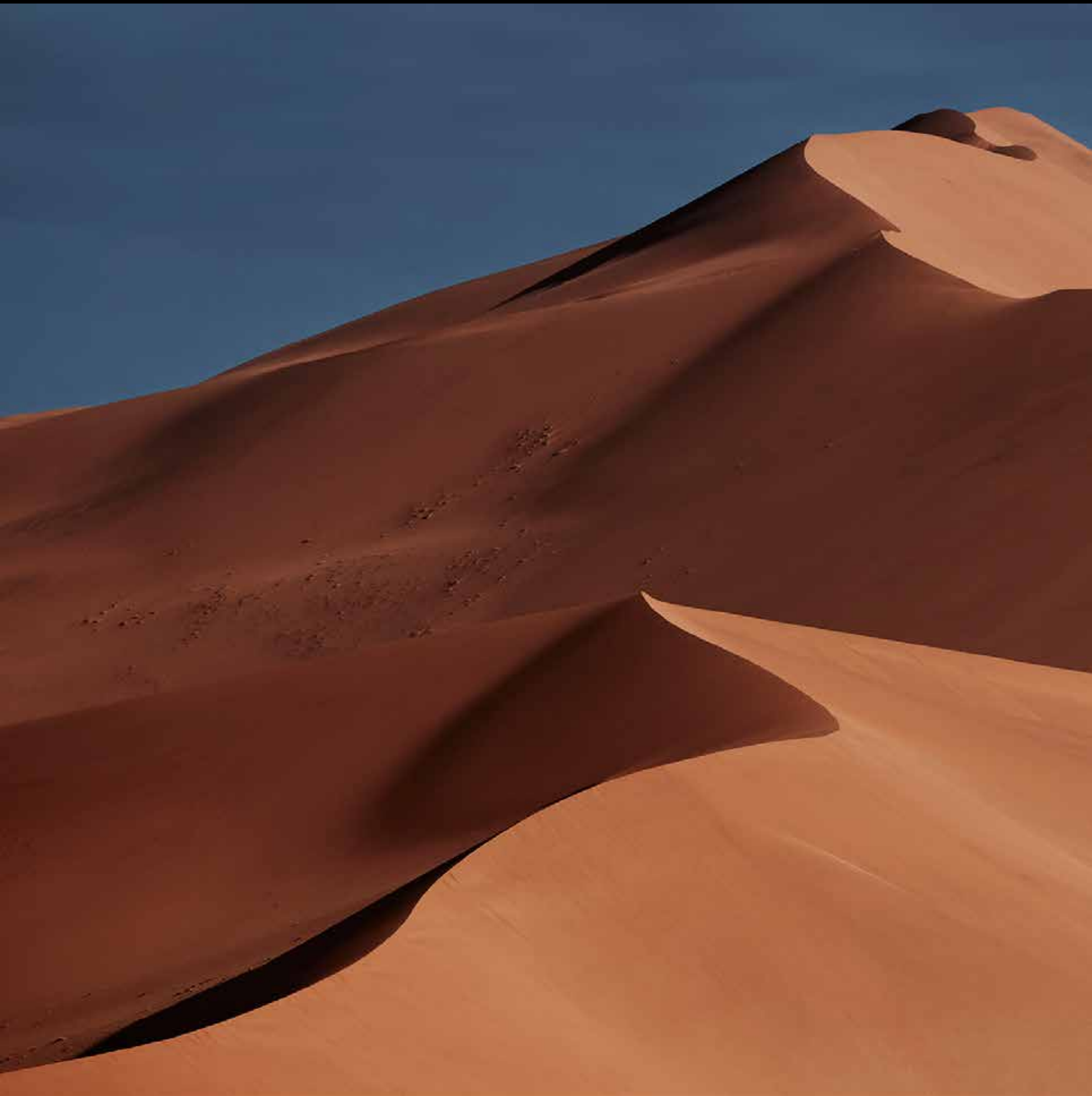
The sand dune Dune 45, located in the Sossusvlei area of Namib-Naukluft National Park. This iconic sand dune is renowned for its striking shape and warm red hues, especially at sunrise and sunset.