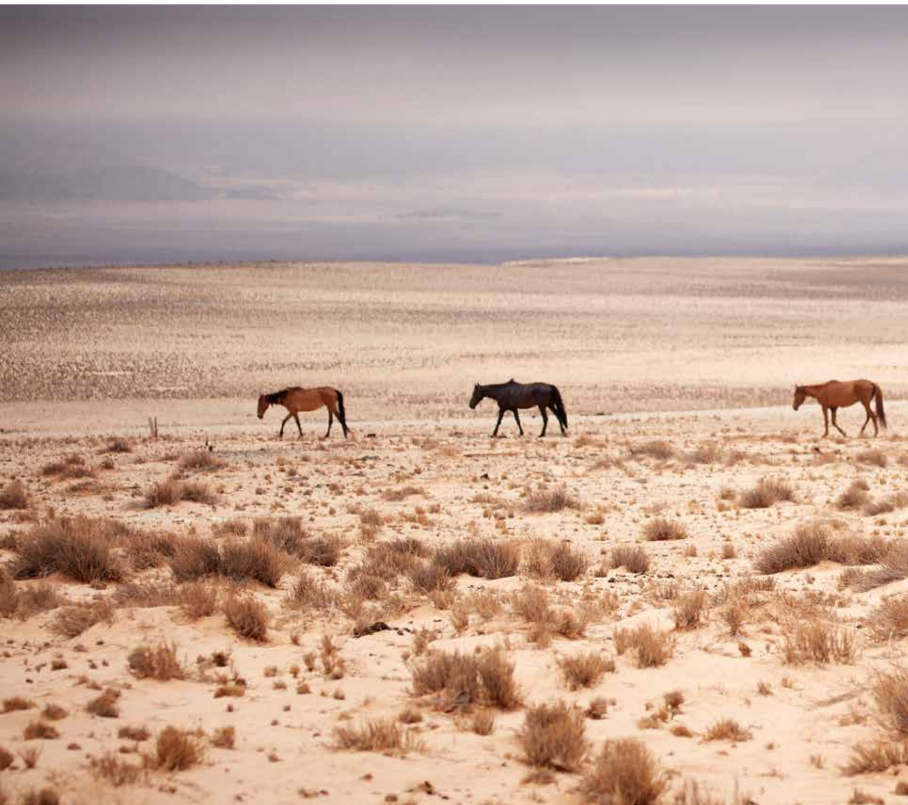
Namibia is home to the legendary wild horses of the Namib Desert, believed to be descendants of cavalry horses left behind during the early 20th century. These resilient animals have adapted to the harsh desert environment, roaming freely near the Garub waterhole outside Luderitz.