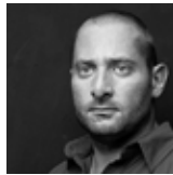
Marco Di Lauro

National Geographic, World Press Photo first place