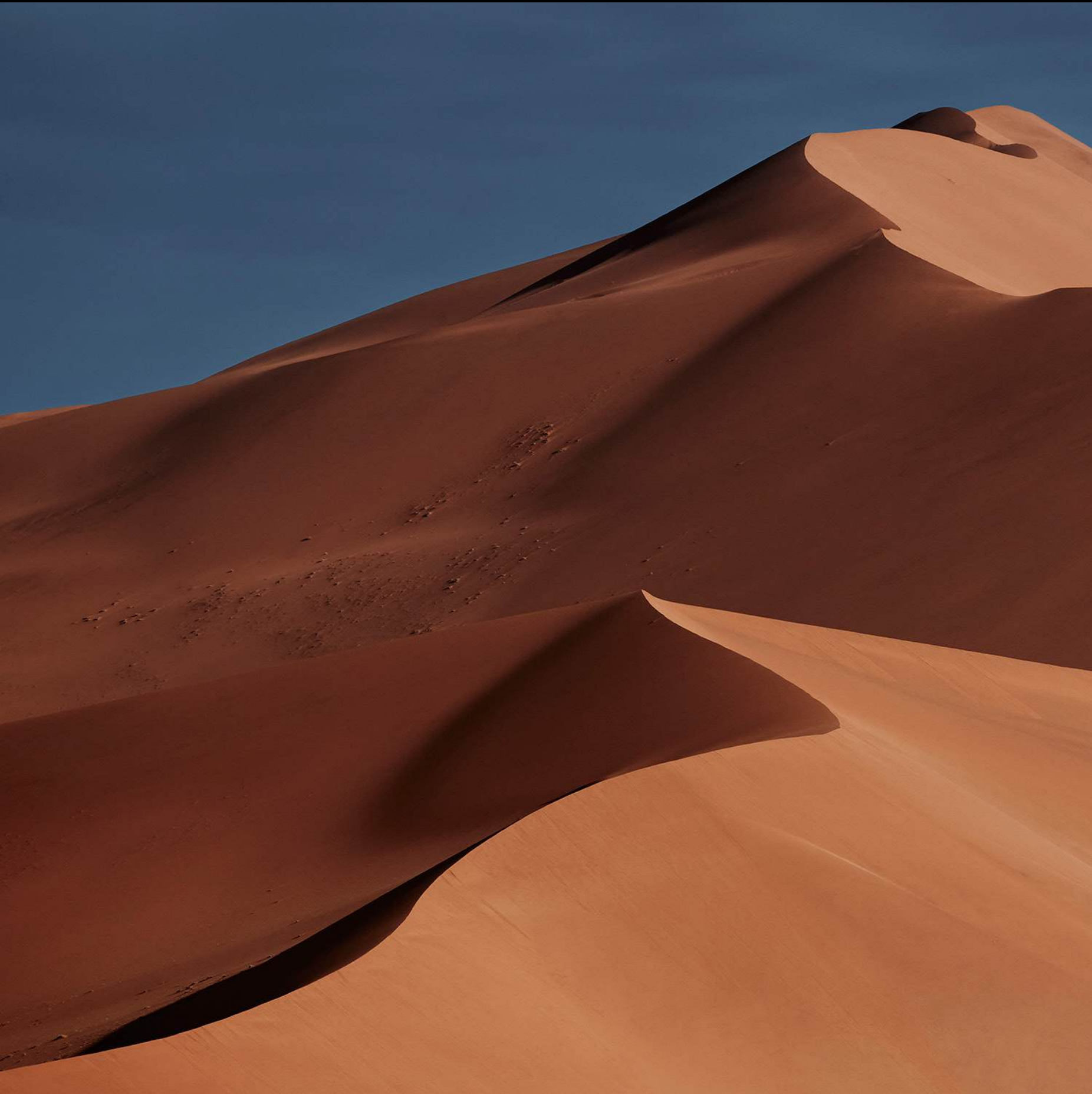
The sand dune Dune 45, located in the Sossusvlei area of Namib-Naukluft National Park. This iconic sand dune is renowned for its striking shape and warm red hues, especially at sunrise and sunset.