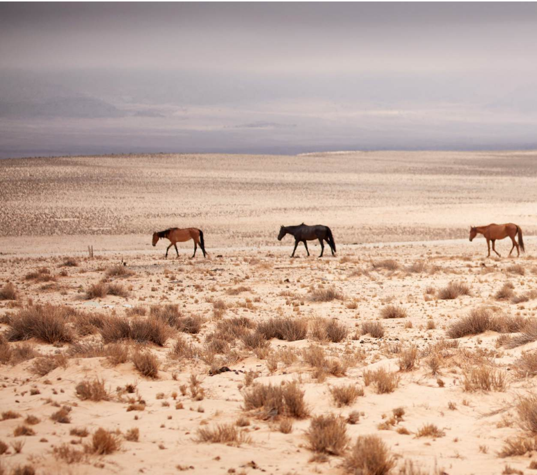
Namibia is home to the legendary wild horses of the Namib Desert, believed to be descendants of cavalry horses left behind during the early 20th century. These resilient animals have adapted to the harsh desert environment, roaming freely near the Garub waterhole outside Luderitz.